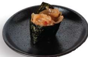
SS08 KURAGE RM4 Seasoned Jelly Fish