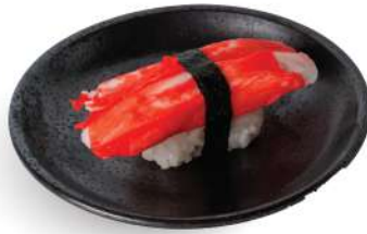
SS17 CRAB STICK RM4 Snow Crab Leg