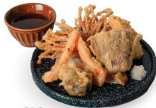
S10 YASAI TEMPURA Deep Fried Assorted Vegetable