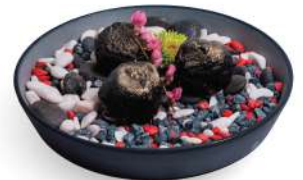
S12 FOIE GRAS PUFF (3pc) Deep Fried Dough w Foie Gras Mousse