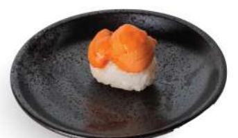
SS15 UNI RM48 Sea Urchin