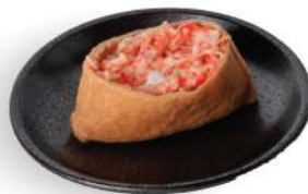
SS02 INARI KANI MAYO RM4 Crabmeat Beancurd