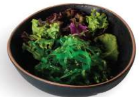
S08 CHUKA WAKAME Seasoned Seaweed