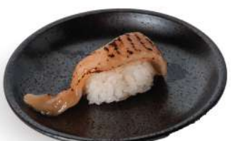
SS13 ENGAWA RM13 Torched Flounder Fin