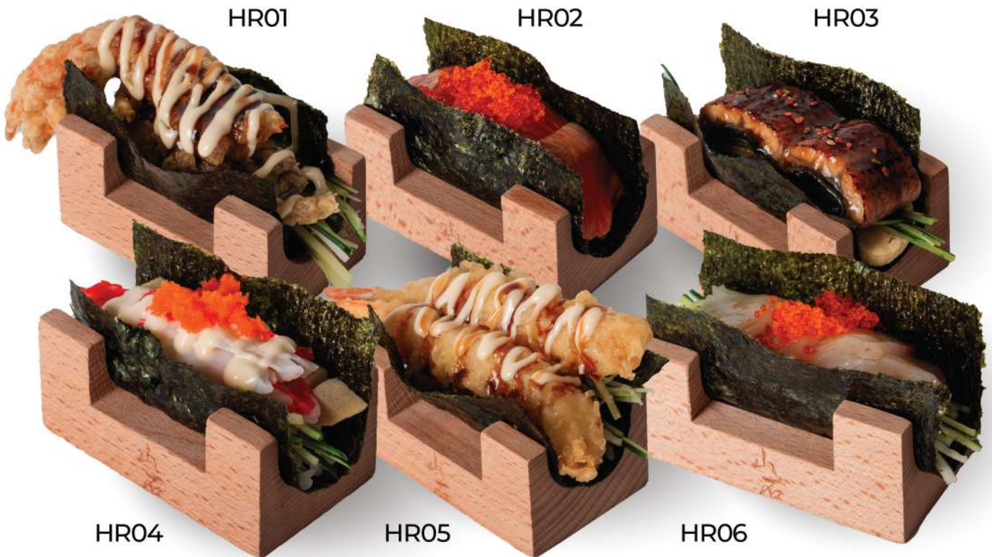
HR01 SOFT SHELL CRAB HR RM14