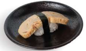
SS03 TAMAGO RM2 Japanese Omelette