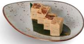
S02 ATSUYAKI TAMAGO Japanese Omelette