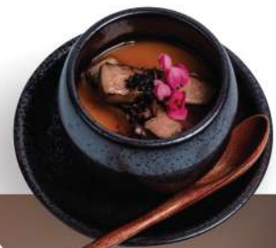
S20 CHANWANMUSHI FOIE GRAS Steam Egg w French Goose Liver RM19