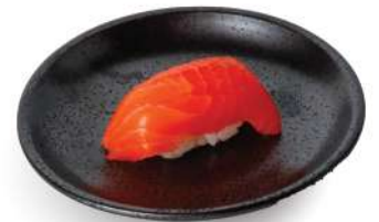
SS09 SALMON RM5 Salmon