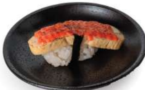
SS04 TAMAGO MENTAI RM3.5 Japanese Omelette w Mentai Sauce