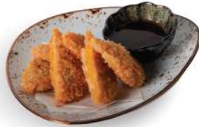
S06 KABOCHA KOROKE Deep Fried Curry Potato Croquette