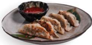
S09 TORI GYOZA Japanese Chicken Dumpling