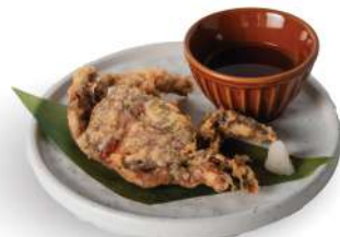
S14 TEMPURA SOFT SHELL CRAB(1pc) Deep Fried Little Shrimp