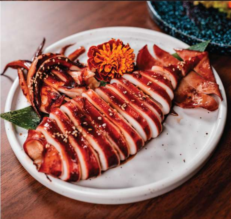
H05 SURUMEIKA SHIOYAKI Salt Grilled Whole Squid