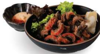
S15 SALMON SKIN Deep Fried Salmon Skin