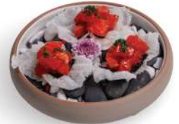
S04 SALMON CANAPE Salmon Cube, Rice Cracker, Flying Fish Roe, Truffle Sauce