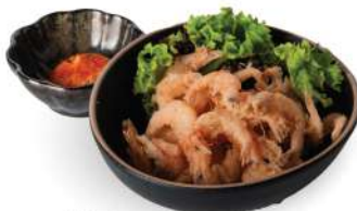
S13 KOEBI Deep Fried Little Shrimp