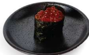
SS05 IKURA RM13 Salmon Roe