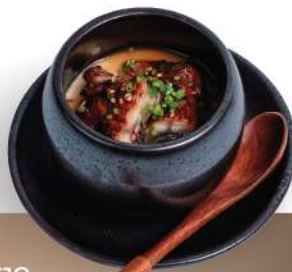
S19 CHANWANMUSHI UNAGI Steam Egg w Grilled Eel RM12