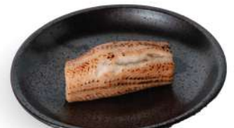
SS12 ANAGO RM12 Sea Eel