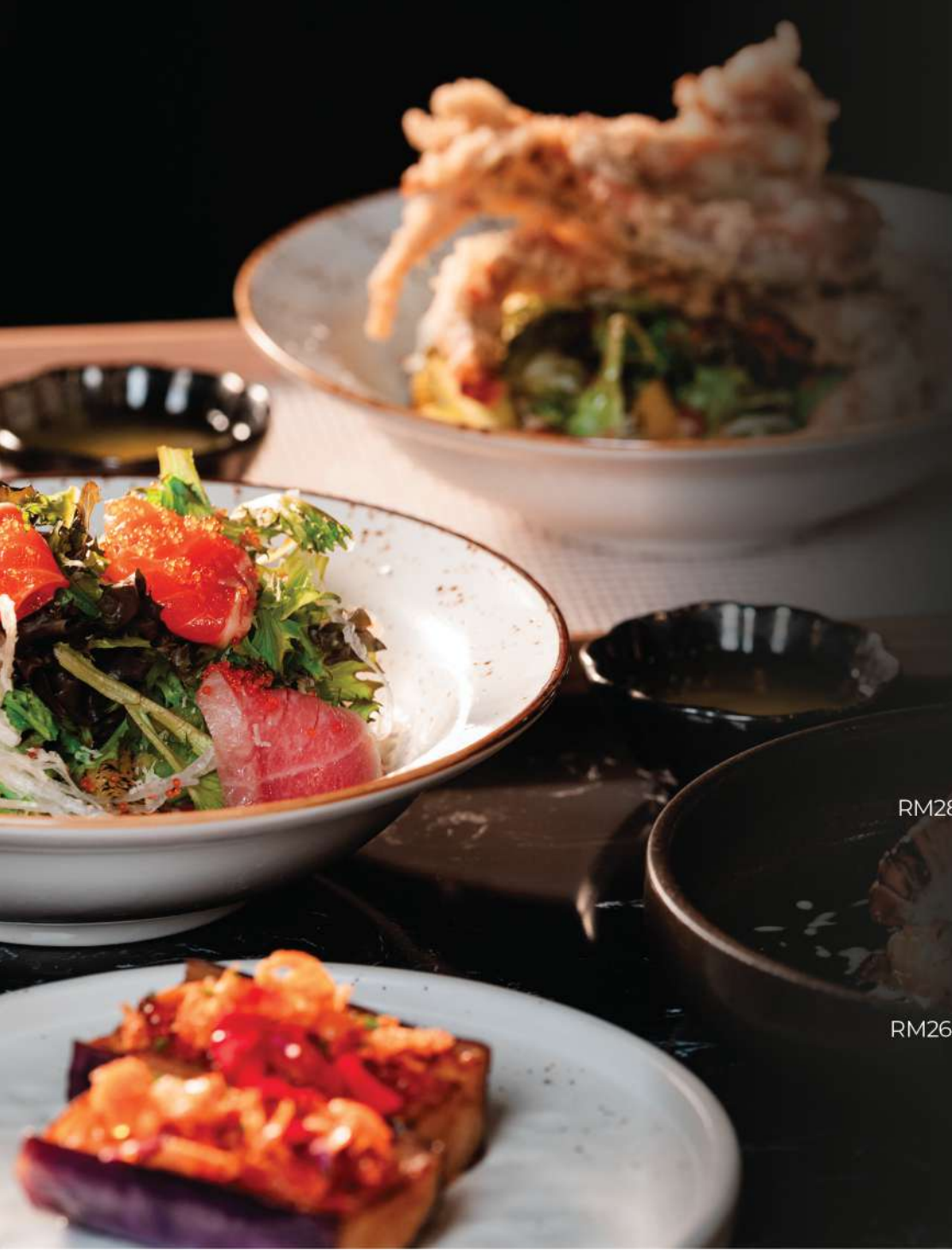
G01 RM16 / SWEET CORN Grilled Corn w Citrus Cream sauce