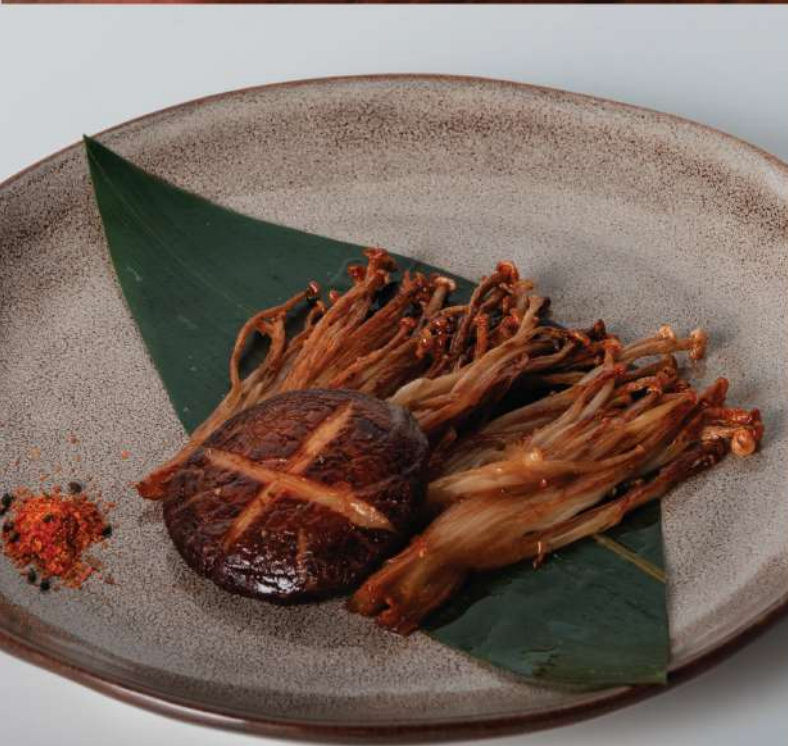
H06 ENOKI BUTTERYAKI Pan Fried Assorted Mushrooms