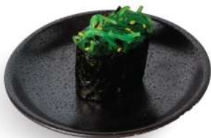
SS07 WAKAME RM4 Seasoned Seaweed