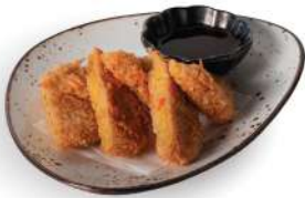
S05 JAGAIMO KOROKE Deep Fried Curry Potato Croquette