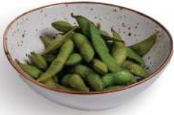
S01 EDAMAME Boiled Green SoyBean