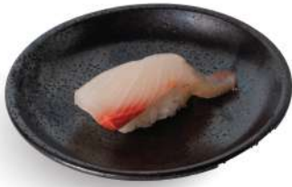
SS16 KANPACHI RM13 Amberjack Fish