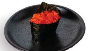
SS06 TOBIKO RM6 Flying Fish Roe