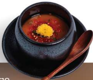
S18 CHAWANMUSHI IKURA Steam Egg w Salmon Roe RM18