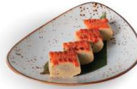
S03 TAMAGO MENTAI Japanese Omelette w Mentai Sauce