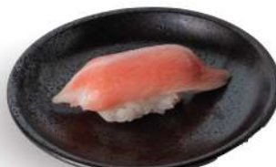
SS11 OTORO RM15 Fatty Tuna