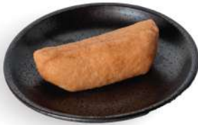
SS01 INARI RM2 Sweet Beancurd