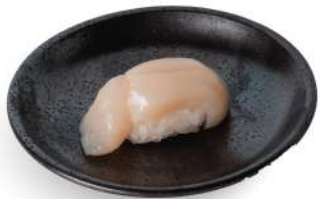
SS14 HOTATE RM11 Scallop