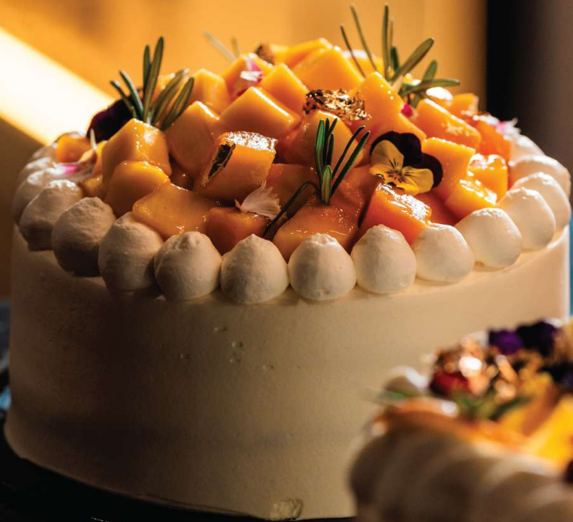
D06 MANGO HIKARI CAKE 6INCH (WHOLE) RM120