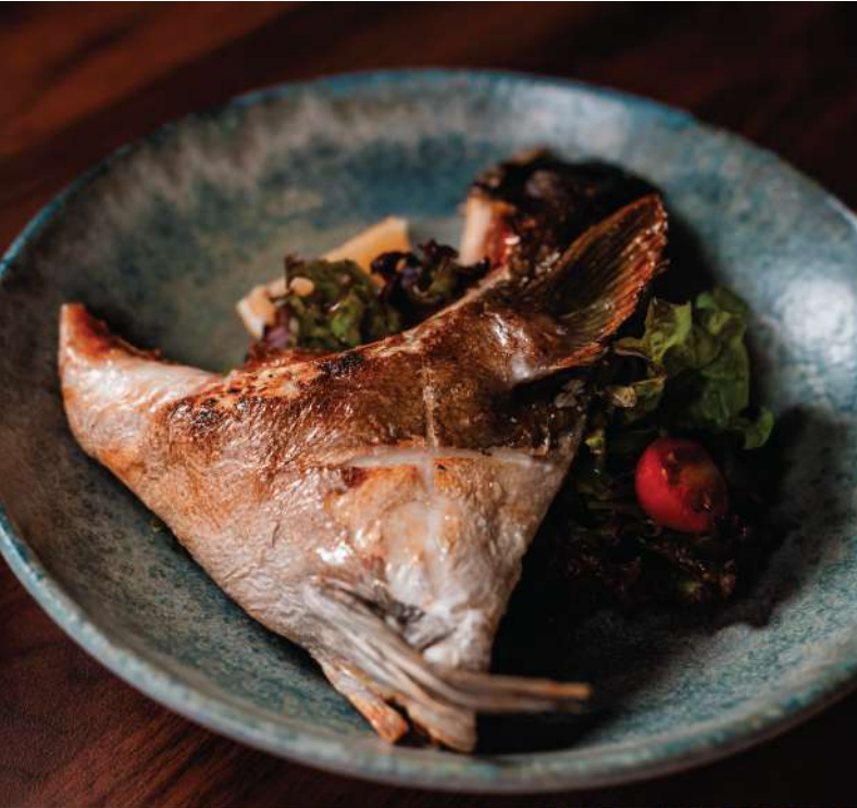
H04 KANPACHI KAMA ( Shio / Teri )