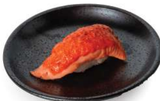
SS10 SALMON MENTAI RM5.5 Torch Salmon w Mentai Sauce