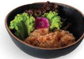
S07 CHUKA KURAGE Seasoned Jelly Fish